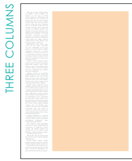
W 7 1/4" x D 13 3/8"