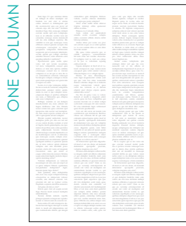
W 2 1/4" x D 13 3/8"