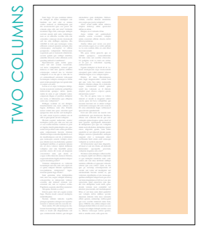
W 4 3/4" x D 13 3/8"