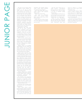
W 7 1/4" x D 10"