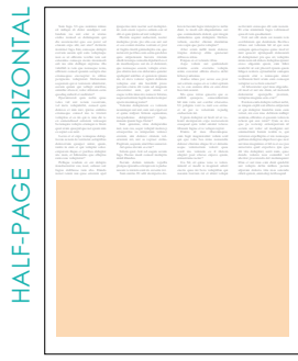
W 9 3/4" x D 6 5/8"